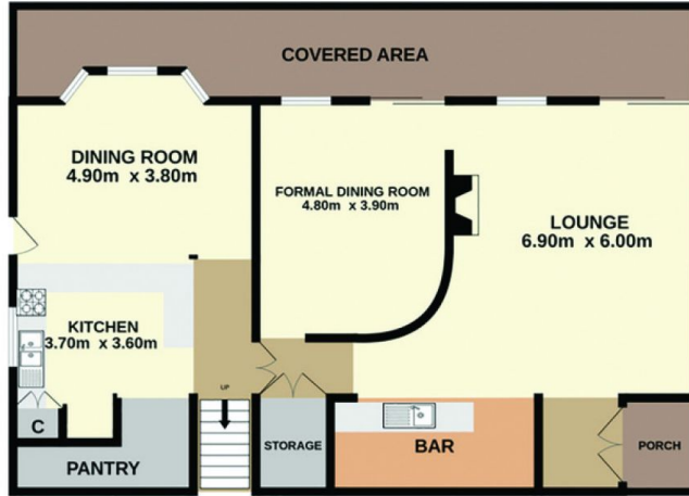
GROUND FLOOR 108.3 sq.m. approx.