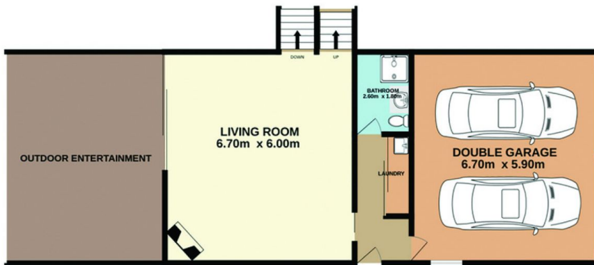
1ST FLOOR 94.4 sq.m. approx.