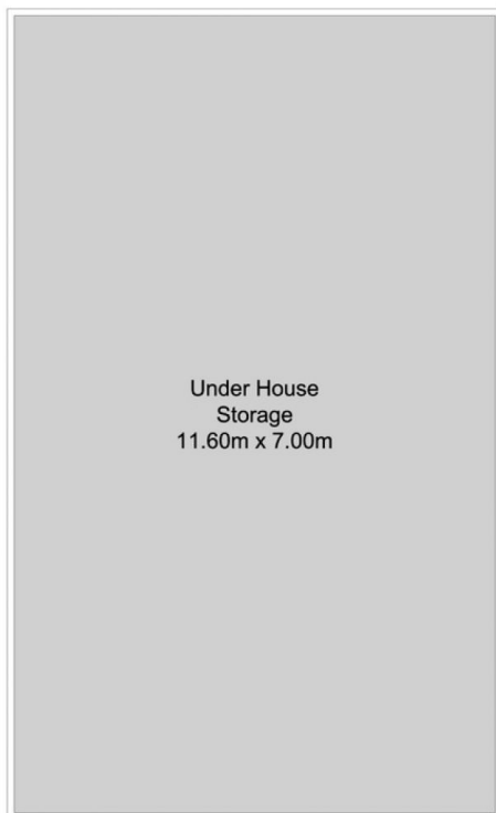
Under House Storage