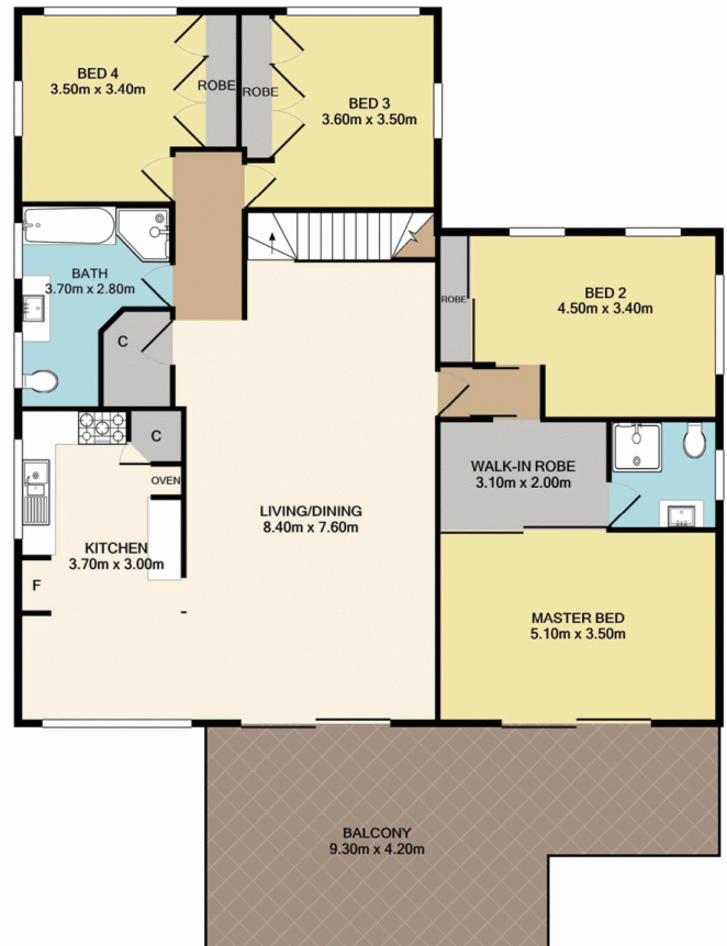
Upper Level 143.4 SQ.M. 1544 SQ.FT.

Total Approx. Floor Area 286.0 SQ.M. 3079 SQ.FT.