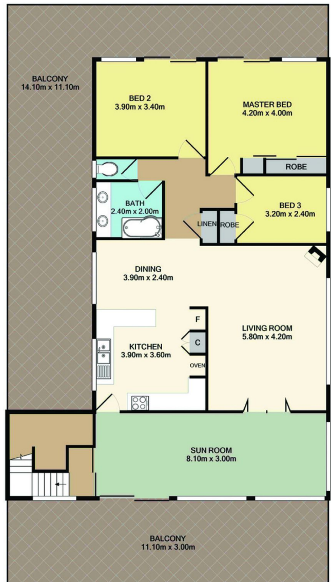
Upper Level 132.1 SQ.M. 1422 SQ.FT.

Total Approx. Floor Area 262.6 SQ.M. 2827 SQ.FT.