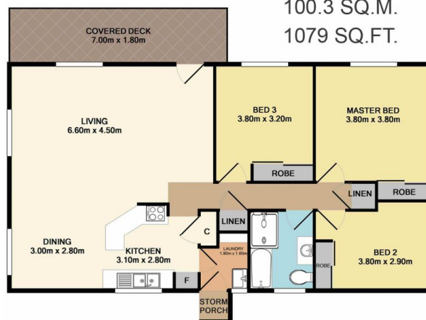
Secondary Residence 100.3 SQ.M. 1079 SQ.FT.

Main Residence Total Approx. Floor Area 175.7 SQ.M. 1891 SQ.FT.